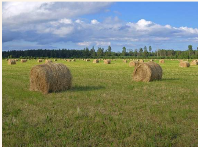
Picture 2. Grassland after mowing, with hay.

Carbon sequestration rates in grassland soils typically range from 1.5 to 4 tonnes CO 2 per hectare per year.