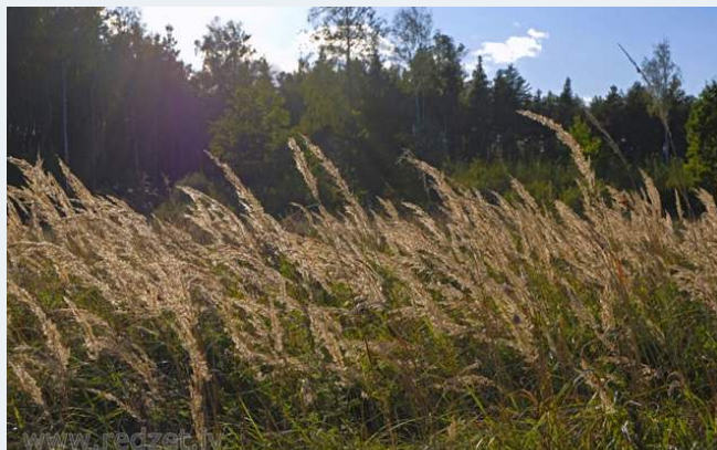
Picture 1. Grass in the meadow.

The species composition of grass is highly diverse and varies depending on the geographic location and environmental conditions. Grasslands are found in a wide range of habitats like meadows, pastures, heaths, and other open areas (Picture 1). The most common grass species in Europe include ryegrass ( Lolium perenne ), fescue ( Festuca spp.), bentgrass ( Agrostis spp.), meadow grass ( Poa pratensis ), timothy grass ( Phleum pratense ), and cocksfoot ( Dactylis glomerata ).